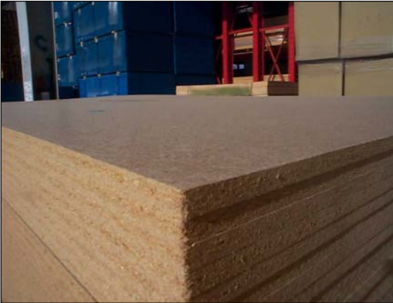
Particleboard and MDF

Evergreen Engineering, Inc. and its technical staff have extensive practical experience in the particleboard and MDF industry. We have been designing new facilities, implementing new technology, and improving process operations at board plants for decades!